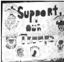
Banner hung on gazebo during rally (Don Peasley photo).