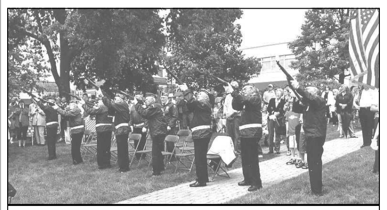
VFW and Woodstock American Legion members fire three volleys to honor veterans of all wars during Memorial Day.

Congratulations to our 2004 Poppy Day workers! You raised $3,880 for selling Poppies. Thanks to all who participated in this event.