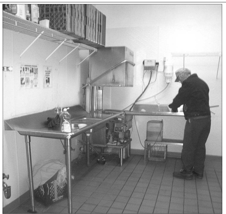
A donated automatic dishwasher, pictured above at the Arlington Heights Elks Lodge, was donated to the Woodstock VFW. The Arlington Heights Elks Lodge is merging with another lodge and getting rid of some of their equipment.