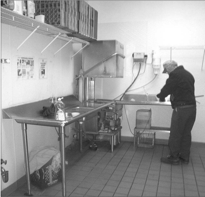
A donated automatic dishwasher, pictured above at the Arlington Heights Elks Lodge, was donated to the Woodstock VFW. The Arlington Heights Elks Lodge is merging with another lodge and getting rid of some of their equipment.